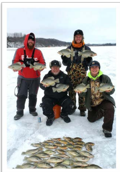
January 2021 picture.

The Otter Trail Riders Snowmobile Club promotes safe snowmobiling thru training and maintains/grooms 150 miles of trails in Otter Tail County. For more information on volunteering to help, or on youth lessons contact Russ Winkels at rwinkels@perham.k12.mn.us .