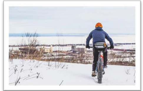
Fat Biking is available on select Nordic Trails at Detroit Mountain.

Following our area’s Scandinavian heritage, we believe there’s no bad weather, only bad clothing. While Minnesota winter hobbies abound, we’ve focused on just a few that are especially popular in our area. Want to try ice-fishing, but don’t have a fish house? No worries, we’ve listed guide services with rental houses below. Want to try cross-country skiing? You can rent skis at Maplelag when you book an overnight stay. But remember, to really enjoy winter you’ll need both INDOOR & OUTDOOR activities . Read along for more ideas. FYI: Two ice rinks are also ready for use outside at the PACC!